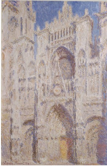
Figure 7.1 | Rouen Cathedral: The Portal (Sunlight)