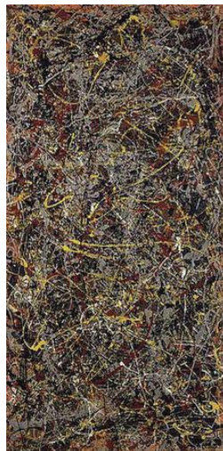
Figure 7.4 | No. 5

Abstract Expressionism took this concept to a greater extreme, by abandoning shape altogether for pure abstraction. This style is typified by the works of the American painter Jackson Pollock (see Image 7.4).