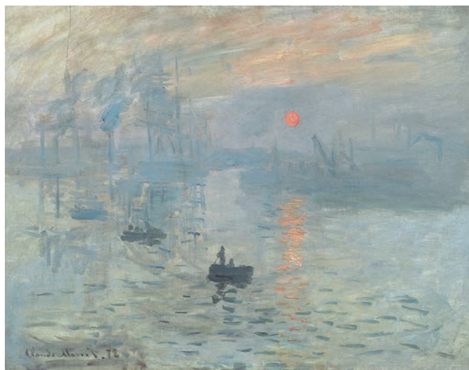
Figure 7.2 | Impression, soleil levant (Impression Sunrise)